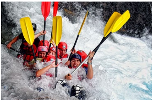
VOIDOMATIS RIVER ZAGORI, EPIRUS